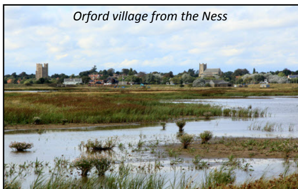
Orford village from the Ness

Many of us chose to brave the five minute boat trip across the river in order to visit the Ness over the weekend, but the major attractions of the village turned out to be the two pubs and the village bakery. I can vouch that their almond croissants are to die for! Saturday evening saw us all holed up in the Jolly Sailor for a meal to the strains of a local folk group, the Whalers, or maybe it was the Wailers, I never did quite work out which.