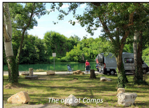
The aire at Comps