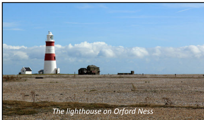
The lighthouse on Orford Ness

In many ways however it is the recent history of Orford which is most fascinating. Orford Ness is a bleak spit of shingle and marshland lying between Orford and the open sea and is now a nature reserve owned by the National Trust. But for much of the 20 th century it was in the hands of the Ministry of Defence and was home to a weapons testing establishment as well as the 'Cobra Mist' cold war listening station. It was here that bombs were environmentally tested to ensure their safety when they were transported. They also had a sophisticated set up for monitoring and recording the trajectories of bombs when dropped from aircraft to help with more accurate targeting.