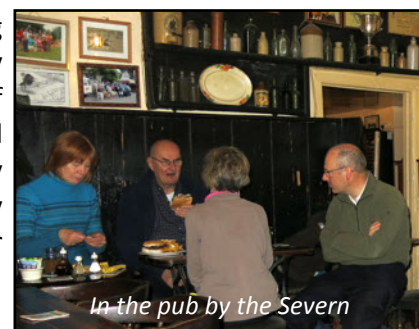
In the pub by the Severn

Let's pray for better weather for next year's AGM!