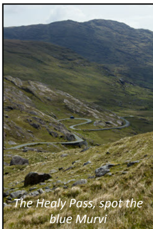
The Healy Pass, spot the blue Murvi