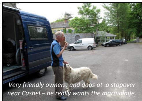
Very friendly owners, and dogs at a stopover near Cashel – he really wants the marmalade.

We thoroughly enjoyed our visit, and whether you enjoy, walking, cycling, touring, visiting piles of old stones or just the relaxed atmosphere, there is something for you. Just make sure you traverse the Ring of Kerry in the same direction as all the tourist coaches.