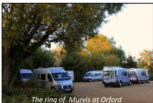
The ring of Murvis at Orford

Spend a weekend camped in a public car park! What a strange idea - or maybe not in this case. The car park at Orford in Suffolk is big, surrounded by trees and thanks to Ian Castle (a Murvi owner who lives in the village) we had a secluded corner of the car park to ourselves. But just to be sure we made a circle of wagons to guard against the marauding yachties.