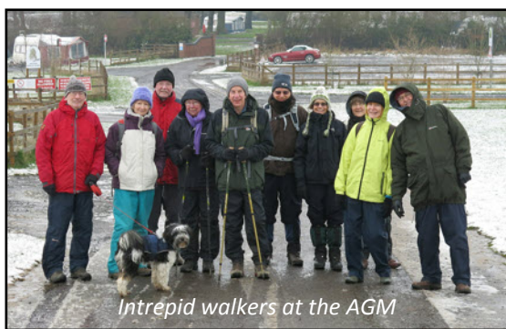
Intrepid walkers at the AGM

What a difference a year makes! Remember those balmy days at Abingdon in March 2012? This year's AGM near Worcester couldn't have been a more stark contrast. Freezing temperatures and a bitter easterly wind tested the resolve of those of us who stuck it out to the bitter end.