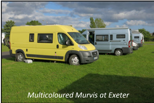
Multicoloured Murvis at Exeter

Of course what appears in the newsletter depends to a large part on all of you taking time off from the pure unadulterated enjoyment of your Murvis to put pen to paper (or rather finger to keyboard). So a big Thank you to those of you who were kind enough to send me items however big or small. Don't forget, you can send me contributions at any time during the year to adrian@sumption.me.uk - I will make sure that I save them for the next edition of the newsletter which will hopefully appear roughly every 6 months.