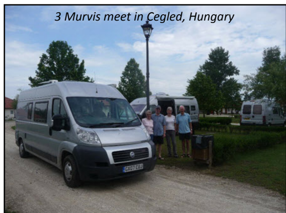
3 Murvis meet in Cegled, Hungary

In typical British fashion, I’ll start with the weather! It has been mixed but thankfully we didn’t suffer the flooding problems which affected Austria, Germany and Prague. We seemed to be on the edge of the system which caused those problems. So we have had very mixed weather with more wet days than sunny ones. Not quite what I was expecting, but apparently places like Transylvania normally have a high rainfall because of the Carpathian mountains. At least it is warm though, so I was able to pack away the thermals I was wearing all the way down through Northern and Central Europe. It’s currently 78 degrees in the van and despite an earlier thunderstorm the sun is now out again.